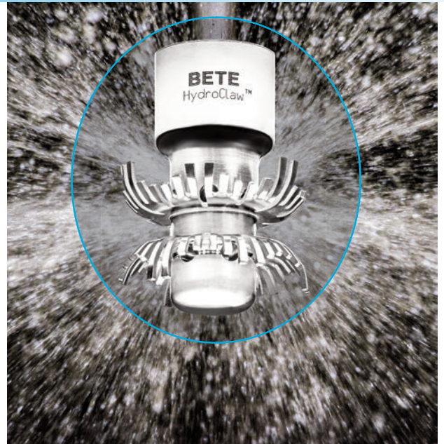
Fermentation tank cleaned with the HydroClaw