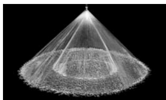
Full Cone 90°

Use of blow-off covers requires a pressure of 25 PSI or higher