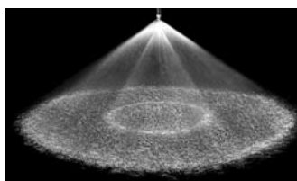
Full Cone 120° (W)