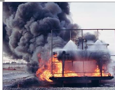
N6 nozzles protect a propane storage tank from fire and explosion.