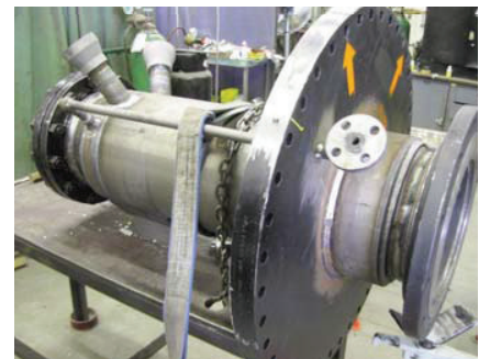
Steam-jacketed fabrication with three spray nozzles installed through the jacket.

Fabrications are BETE's specialty, from complex Code compliant fabrications to simple pipe and flange assemblies. By using BETE as a single source supplier, you can concentrate on your larger process details, knowing that our experience is working for you.