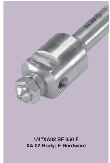
1/4"XA02 SF 050 F XA 02 Body; F Hardware

Dimensions are approximate. Check with BETE for critical dimension applications.