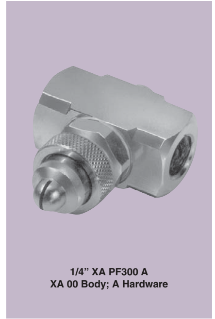
1/4" XA PF300 A XA 00 Body; A Hardware

Dimensions are approximate. Check with BETE for critical dimension applications.