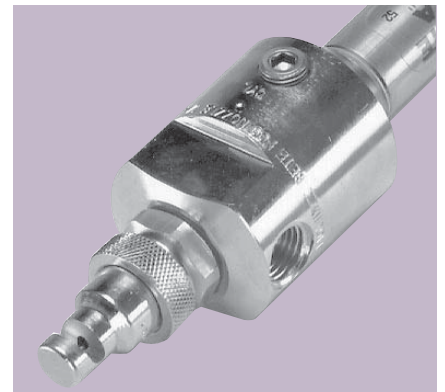
1/4"XA 01 FF050 F XA01 Body; F Hardware