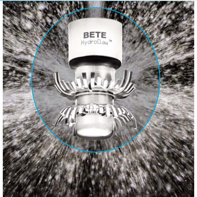
Fermentation tank cleaned with the HydroClaw