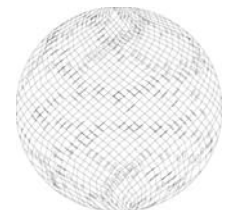
4 nozzle spray pattern